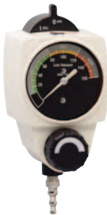
6700-1227-901 Two Mode Low Continuous 0-160 mmHg gauge