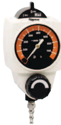
6700-1226-901 Three Mode High Continuous 0-760 mmHg gauge