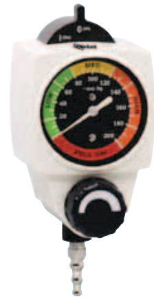
6700-1225-901 Standard Two Mode Continuous 0-200 mmHg gauge