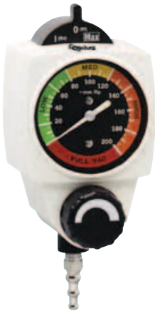
6700-1224-901 Standard Three Mode Continuous 0-200 mmHg Gauge