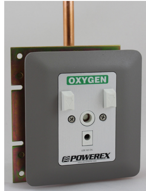
Part Number PX-ALN91XA1124 shown

The name of the gas service shall be permanently marked on the outlet bracket and the outlet. The outlet's rough-in supply tube shall be a 7 inch (18 cm) length of ½ OD copper