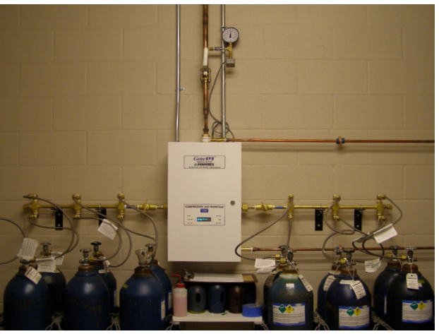
Model PX-CCU12NO1W shown above

The NFPA 99 compliant digital, fully automatic manifold shall be a Powerex Genesys™ series. No manual resetting of valves or levers shall be required. The unit shall switch from "Bank in Use" to "Reserve" bank without fluctuation in line delivery pressure. Simultaneously, the "Reserve in Use" alarm shall be triggered by the manifolds microprocessor. The manifold shall continue to provide gas, in the event of a power failure, until both banks are depleted. After the switchover, the "Reserve" bank shall then become the "Bank in Use". The manifold microprocessor shall also trigger the "High Line Pressure" and "Low Line Pressure" alarms without the need for additional pressure switches or transducers. The manifold shall be capable of being upgraded after installation, to be used with low or medium pressure portable bulk vessels or for use at higher or lower delivery pressures.